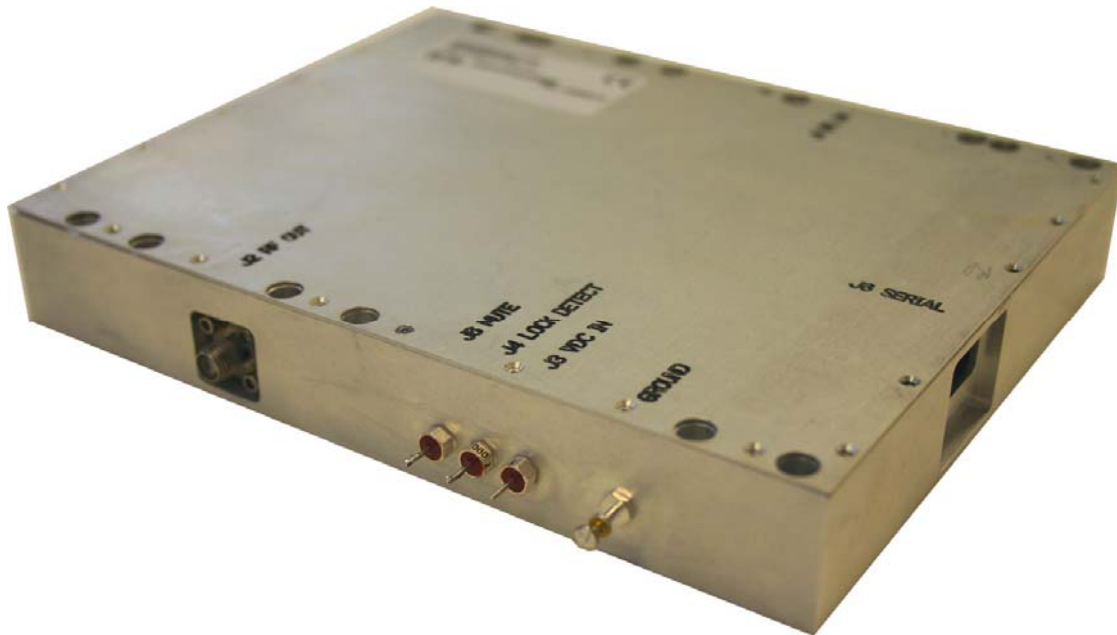
ZBUC L-band Block Up Converter

Paradise Datacom's modular ZBUC L-Band Block Up Converter module is an ideal companion product for any microwave power amplifier system requiring L-Band input.